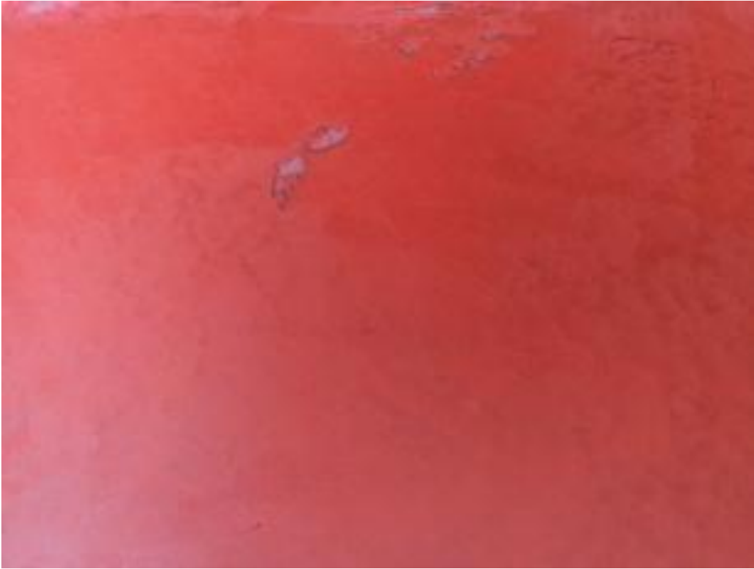
Above: 2nd Coat: Antique Venetian red stucco with surface antique crazing