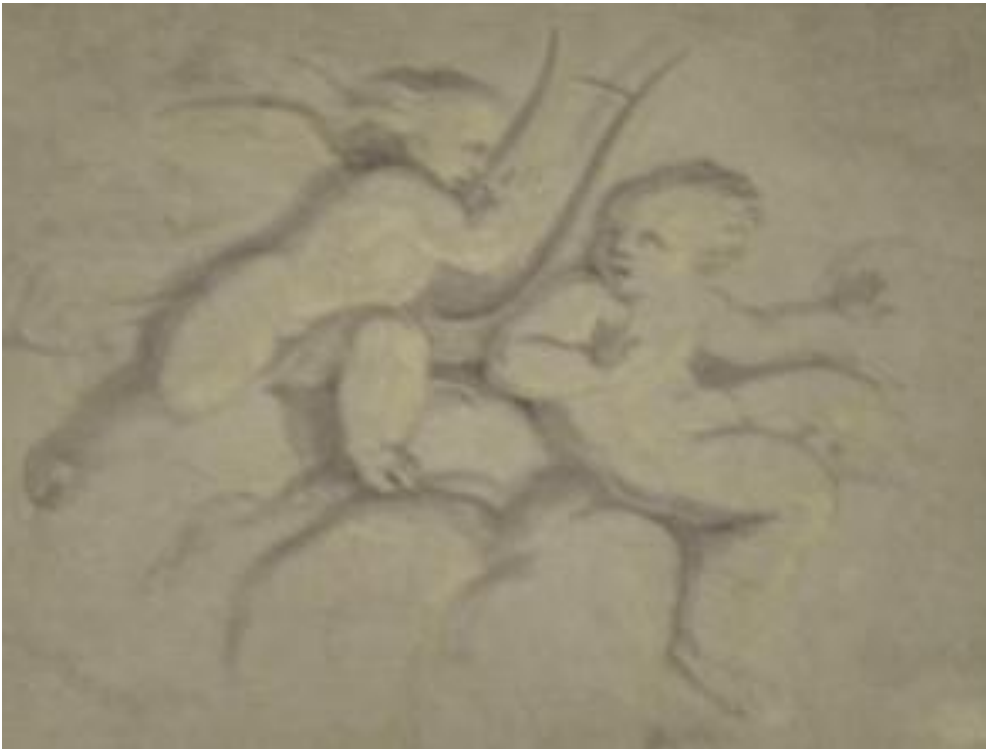
A casa Parma