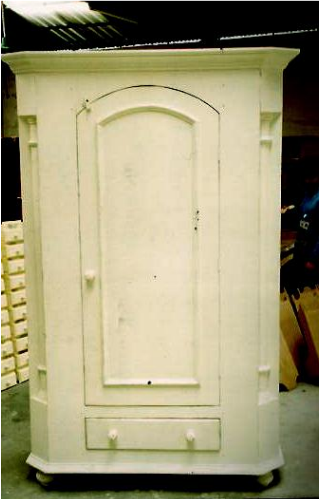
Furniture design 1999 – Item designed for USA retailer Pier 1 Imports