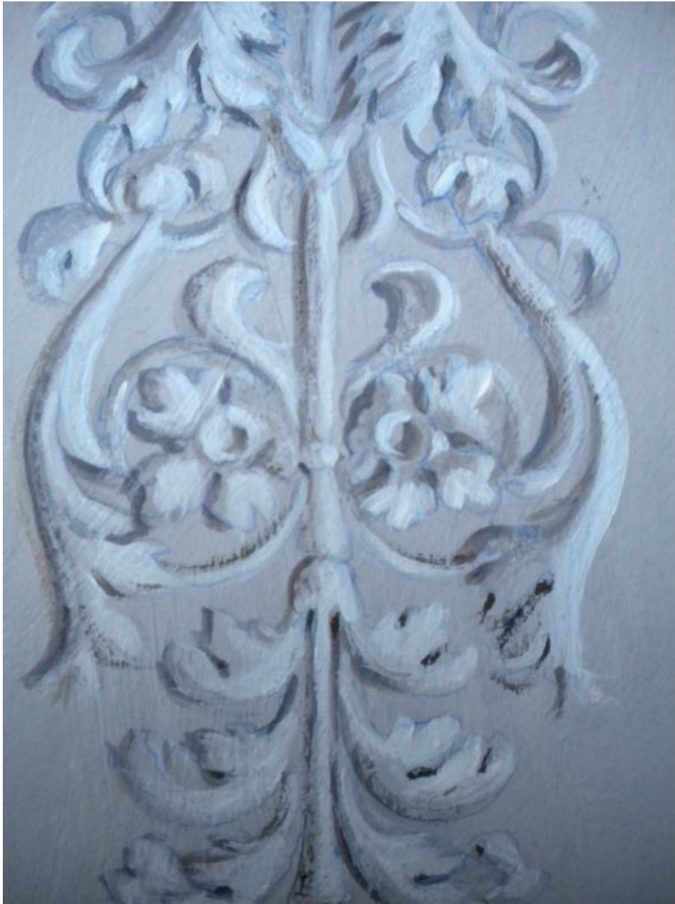
Detail – quasi secco technique