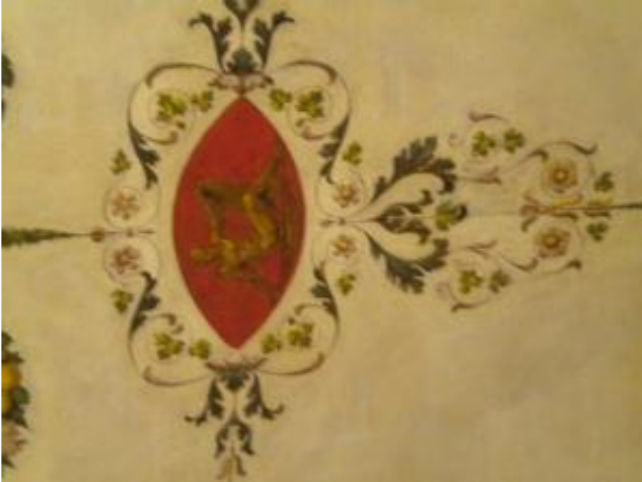
Inspiration for the classic interior: Italian Fresco