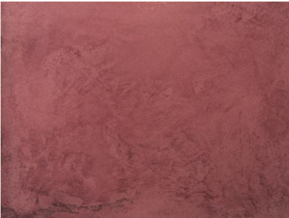
Antique Stucco Veneziano