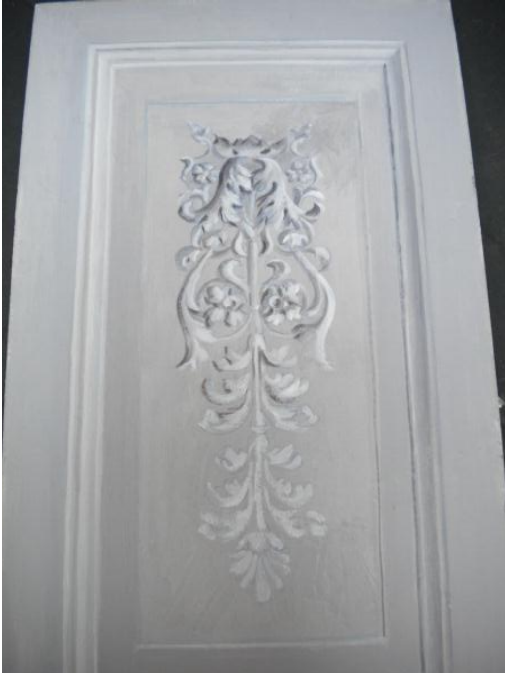
Painted panel - Gesso and Stucco base